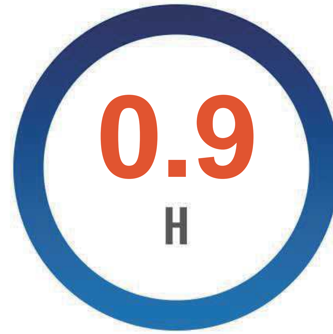
Pulling down to 5°C