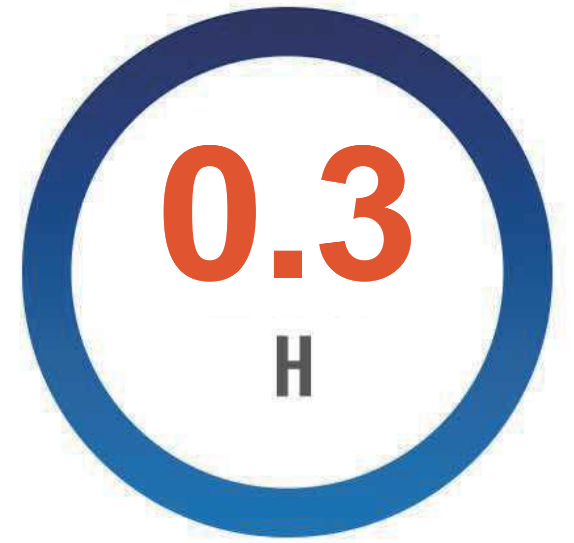
Recovery time after 1 minute door open

*Typical freezer data based on internal testing with freezer set point at 5°C and ambient temperature at 22°C.